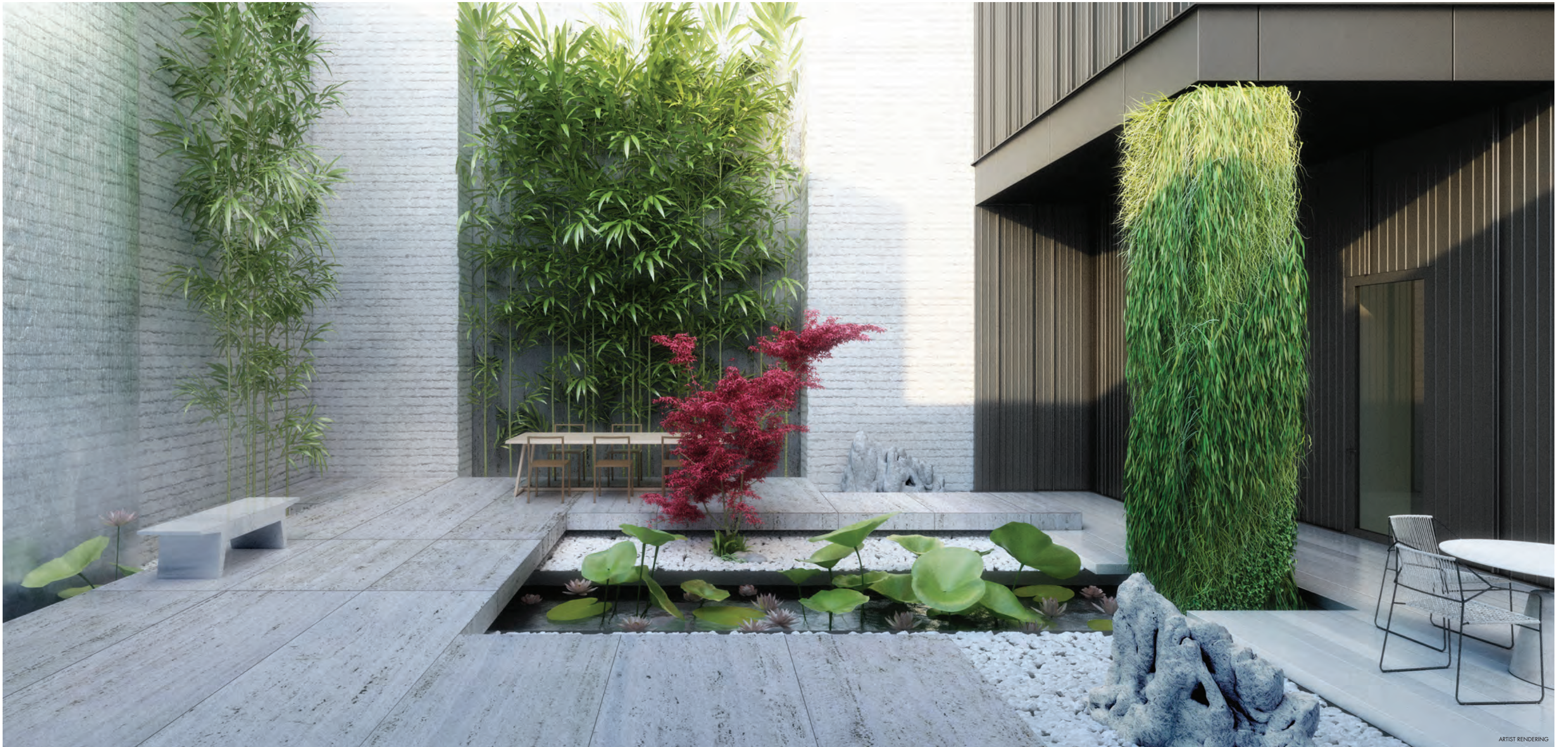
The garden of 809 Broadway is a relaxing oasis during the work day. Casually dine, converse or even entertain clients in the Zen-inspired outdoor space.