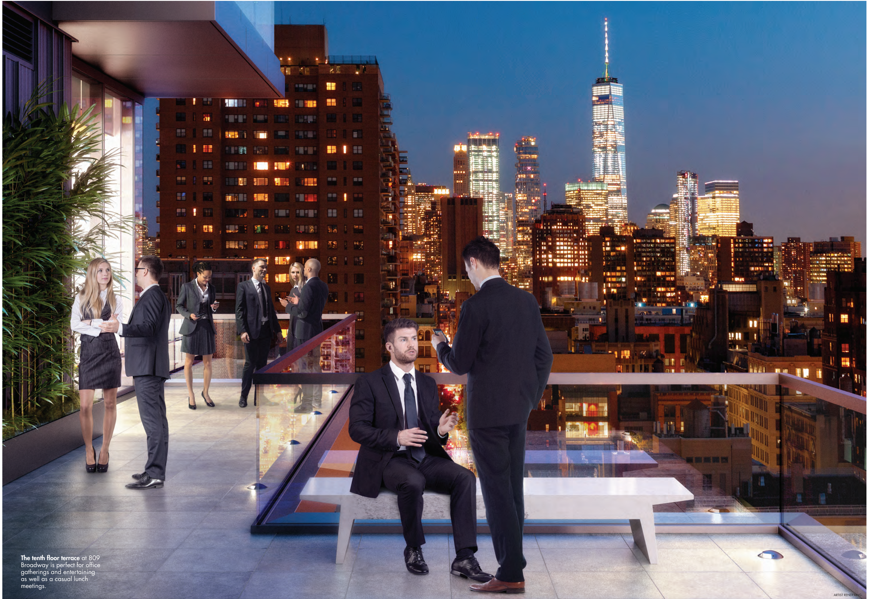
The tenth floor terrace at 809 Broadway is perfect for office gatherings and entertaining as well as a casual lunch meetings.